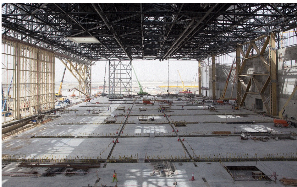
The main hangar at the New Doha International Airport in Doha, Qatar, the largest in the world when finished, features a column-free interior spanning 550 meters.

The 186,000 m 2 (2,000,000 sq. ft.) main facility will be the new central maintenance hub for Qatar Airways' International fleet. The fully-air conditioned hangar will have the