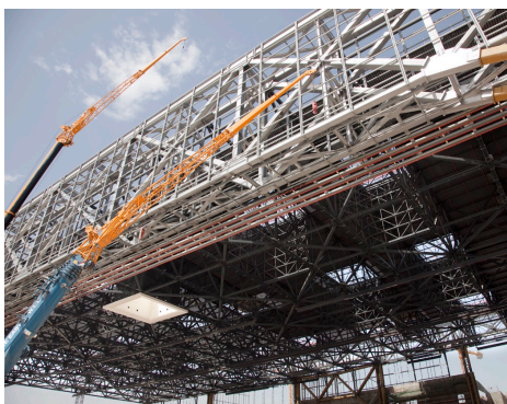
The hangar's massive roof structure will house the fire curtain safety system.