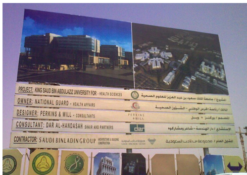
This sign marks the site of the new KSU of Health Sciences in Riyadh.

The VAV units will be installed in over 30 buildings making up a main campus that will span an area of 5,000,000 square meters. The main campus will house the administration complex, health colleges including the College of Medicine, College of Nursing, Women's College of Medicine, Dentistry College, College of Medical Applied Sciences, College of Pharmacy, Public Health College, Basic Health Sciences College and Deanship of Graduate Studies.